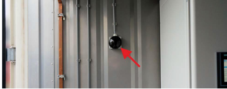
Process Stop Button in ESI Room

Note that a process stop is not an emergency stop that will isolate TheBattery from electric supply. The AC bus bars in the ESI cabinet are still connected to the grid and energized!