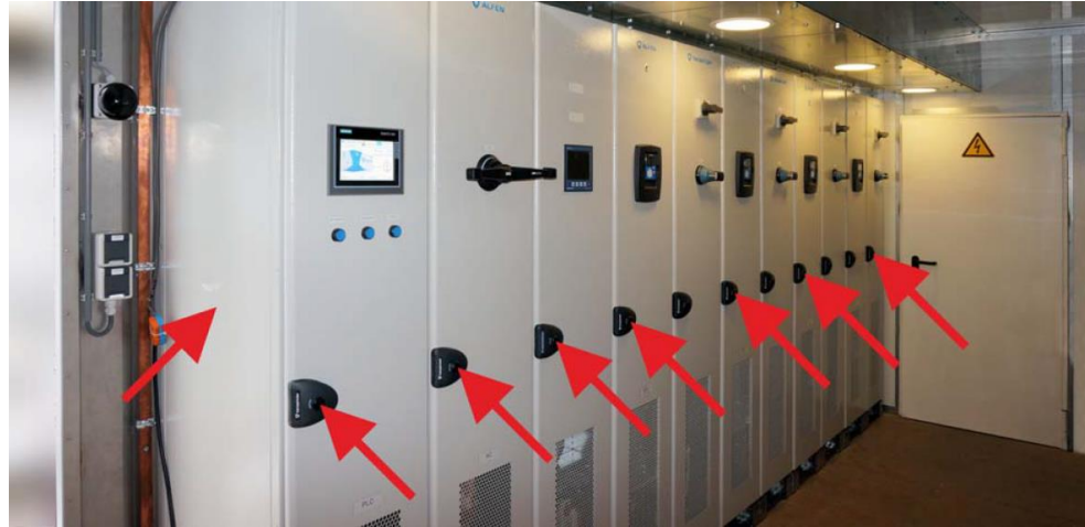
Sample of Safety Doors and Covers

Note: this does not mean that the ESI-cabinet is completely de-energized. Hazardous voltages are still present on the AC bus and DC bus!